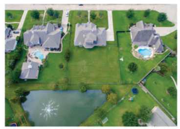
20914 E. Cameron Ridge | $540,000 4 bedrooms / 4 full baths, 1 half bath / 4 car garage SOLD!