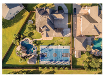
20923 E. Cameron Ridge | $650,000 5 bedrooms / 3 full and 2 half baths / 3 car garage PENDED IN 3 WEEKS!