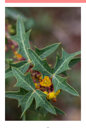
Agarita showing its simple trifoliate leaflets.

One of the constant debates in the botany world is whether or not the genus Mahonia should stand alone or be included in the genus Berberis. This discussion is based on the fact that several species in both genera are able to hybridize, and when viewed as a whole, no consistent separation exists except for simple versus compound leaves. Taxonomy debate aside, the two most marvelous Mahonias in Texas are the well-known Agarita (Mahonia trifoliata) and the lesser-known Texas Barberry (Mahonia swaseyi).