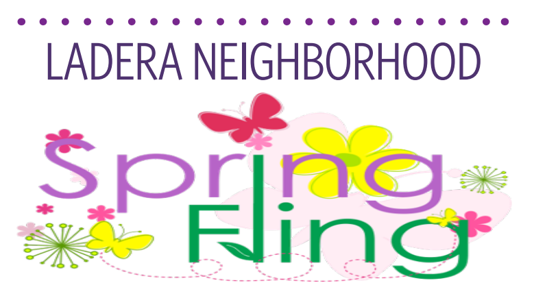
When: Saturday, April 7th Time: 10am – Noon Location: Cul-de-sac at the top of Tordera Petting Zoo, Fun Crafts, Breakfast Tacos from Hat Creek!

Please vote in this important election. Early Voting begins on Monday, April 23rd and ends Tuesday, May 1st and will take place at Bee Cave City Hall located behind the library in the Hill Country Galleria.