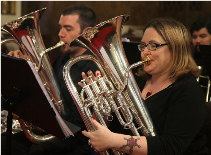
Volunteers are need to help remove brush and reduce the threat of wildfire at a Firewise Field Day on April 7 at Lakeway City Park.

The Austin Brass Band's one-hour concert is being produced by the City of Lakeway's Arts Committee. For information, call the Activity Center at 512-261-1010.