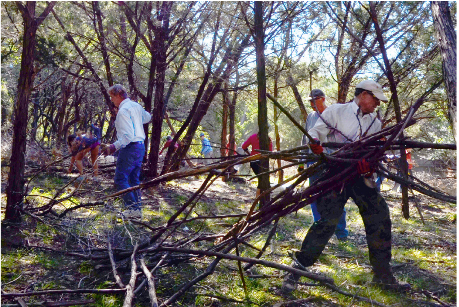
Volunteers are need to help remove brush and reduce the threat of wildfire at a Firewise Field Day on April 7 at Lakeway City Park.

For information, contact Lakeway City Forester Carrie Burns at 512-314-7538 or forester@lakeway-tx.gov .