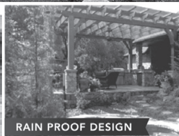
RAIN PROOF DESIGN