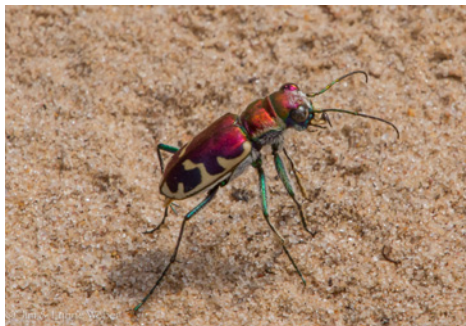
'Big Sand Tiger Beetle

an unusual form of pursuit where they alternatively sprint quickly toward their prey then stop and visually reorient, eventually running down their target. In fact, some tiger beetles can run at a blazing speed of 5 mph, and are considered one of the fastest running land animals for their size!