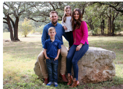
FAMILY OWNED AND OPERATED