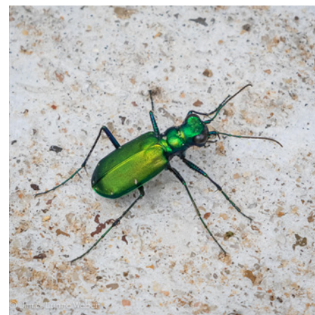
Ocellated Tiger Beetle

Send your nature-related questions to naturewatch@austin.rr.com and we'll do our best to answer them. If you enjoy reading these articles, check out our books, Nature Watch Austin and Nature Watch Big Bend (published by Texas A&M University Press), and our blog at naturewatchaustin.blogspot.com .