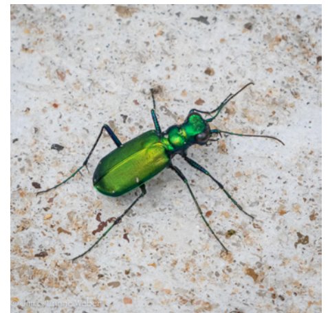
Ocellated Tiger Beetle

Send your nature-related questions to naturewatch@austin.rr.com and we'll do our best to answer them. If you enjoy reading these articles, check out our books, Nature Watch Austin and Nature Watch Big Bend (published by Texas A&M University Press), and our blog at naturewatchaustin.blogspot.com .