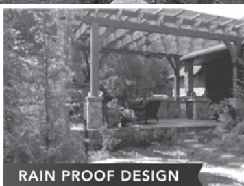
RAIN PROOF DESIGN