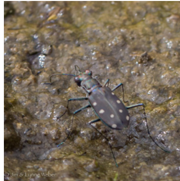
Six-spotted Tiger Beetle

species have metallic, flashy elytra. In Eastern and Central Texas, the Big Sand Tiger Beetle ( Cicindela formosa ) and Festive Tiger Beetle ( Cicindela scutellaris ) prefer the dry sandy areas of post oak woodlands. The Big Sand Tiger Beetle has luminous reddish-purple elytra with irregular white marks around the edges and the Festive Tiger Beetle's elytra are iridescent reddish-bronze to purple to