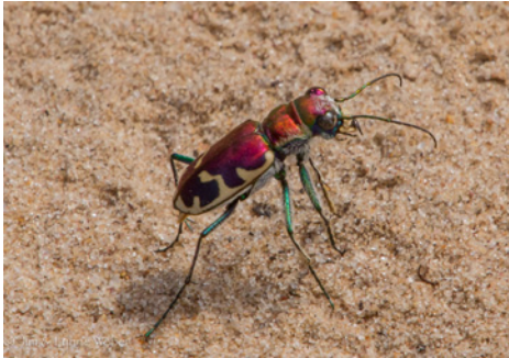
'Big Sand Tiger Beetle

an unusual form of pursuit where they alternatively sprint quickly toward their prey then stop and visually reorient, eventually running down their target. In fact, some tiger beetles can run at a blazing speed of 5 mph, and are considered one of the fastest running land animals for their size!