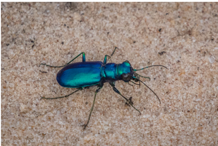
Festive Tiger Beetle