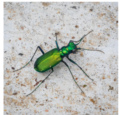
Ocellated Tiger Beetle

Send your nature-related questions to naturewatch@austin.rr.com and we'll do our best to answer them. If you enjoy reading these articles, check out our books, Nature Watch Austin and Nature Watch Big Bend (published by Texas A&M University Press), and our blog at naturewatchaustin.blogspot.com .