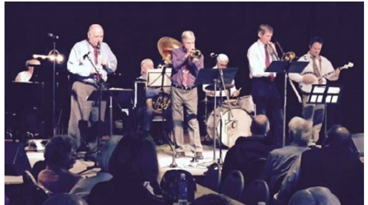
The Second Line Jazz Band will perform a free concert at 7:30 p.m. May 4 at the Lakeway Activity Center, 105 Cross Creek.

The audience may bring their refreshments as none will be available. For information, call the Lakeway Activity Center at 512-261-1010.