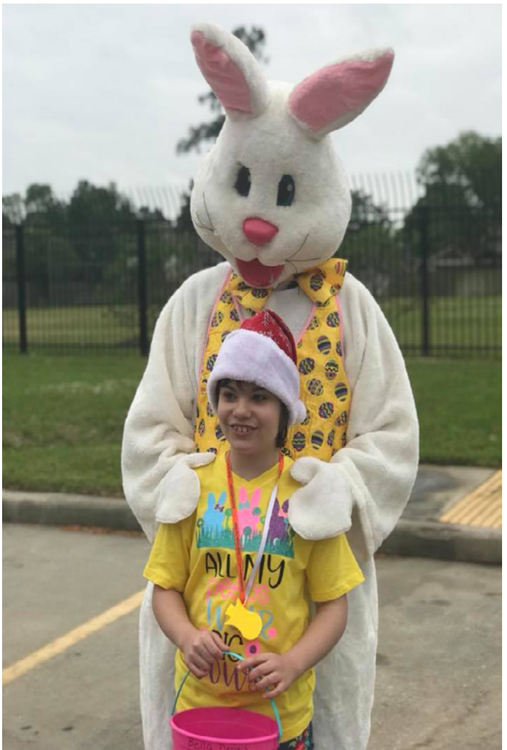
(Continued on Page 3)