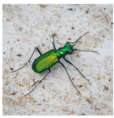
Ocellated Tiger Beetle

Send your nature-related questions to naturewatch@austin. rr.com and we'll do our best to answer them. If you enjoy reading these articles, check out our books, Nature Watch Austin and Nature Watch Big Bend (published by Texas A&M University Press), and our blog at naturewatchaustin. blogspot.com.