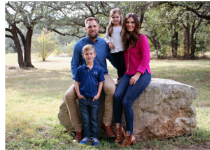
FAMILY OWNED AND OPERATED