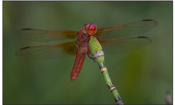
Dragonflies, like this Neon Skimmer, love to perch on the cones of the horsetail's upright stems

Horsetail prefers open or wooded areas along streams, moist flats, and wet ledges. Like ferns and other related species, horsetails reproduce by spores rather than through seed-producing flowers. These spores are borne in cone-like structures at the tips of