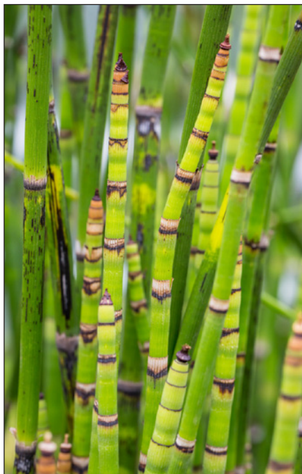
Horsetail or Scouring Rush

The primary species of horsetail that occurs natively in wet or moist areas of Texas, most commonly on the Edwards Plateau and in Blackland Prairie, as well as most of the non-tropical northern hemisphere, is Equisetum hyemale . A spreading, reed-like perennial growing to 3 feet tall, each stem is evergreen, cylindrical, jointed, hollow, and about 1/4 of an inch in diameter. In this species, the needle-like branches appear non-existent, but are actually small and fused around the stem at each joint or node, forming a blackish-green band or sheath. Interestingly, the