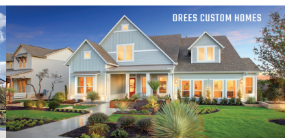
DREES CUSTOM HOMES

708 HEADWATERS BOULEVARD | DRIPPING SPRINGS, TX 78620