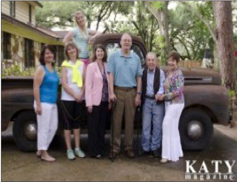
The Cardiff families are descendants of the namesake family for Cardiff Junior High School