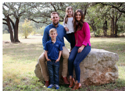
FAMILY OWNED AND OPERATED