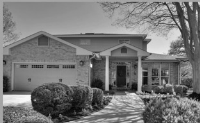
SOLD 5803 Tom Wooten Drive | The Courtyard