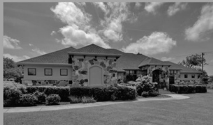
525 River Chase Blvd | $639,900 River Chase | 4 Bd 3 Ba