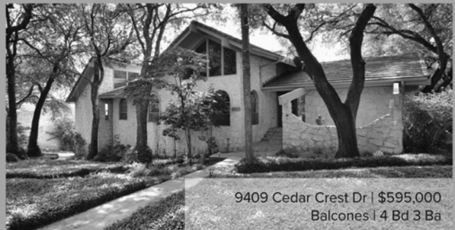
9409 Cedar Crest Dr | $595,000 Balcones | 4 Bd 3 Ba