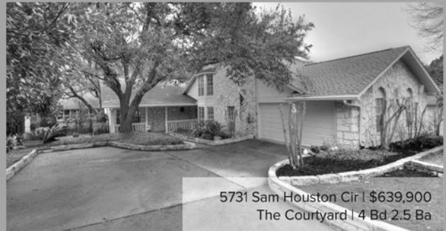
5731 Sam Houston Cir | $639,900 The Courtyard | 4 Bd 2.5 Ba