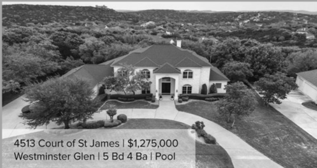
4513 Court of St James | $1,275,000 Westminster Glen | 5 Bd 4 Ba | Pool