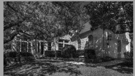
9938 Jasmine Creek Dr | $518,000 Canyon Creek | 4 Bd 3 Ba | Pool