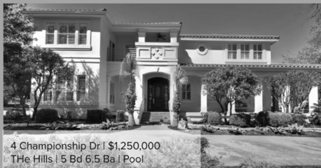
4 Championship Dr | $1,250,000 The Hills | 5 Bd 6.5 Ba | Pool