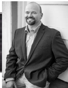
Lakes of Rosehill Resident & Your Neighbor