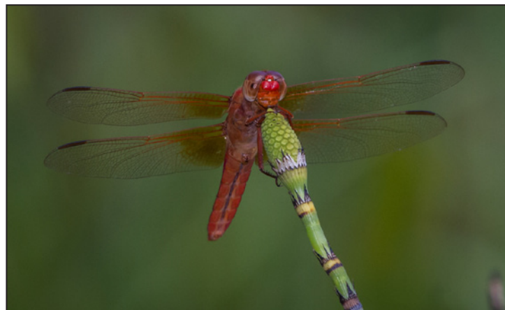
Dragonflies, like this Neon Skimmer, love to perch on the cones of the horsetail's upright stems

Horsetail prefers open or wooded areas along streams, moist flats, and wet ledges. Like ferns and other related species, horsetails reproduce by spores rather than through seed-producing flowers. These spores are borne in cone-like structures at the tips of