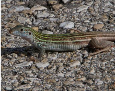
Common Spotted Whiptail

Small to medium-sized slender lizards, whiptails and racerunners can be distinguished from other lizard species by their generally granular dorsal (topside) scales, larger rectangular ventral (underside) scales arranged in transverse rows, long tails, and forked, snake-like tongues. Additionally, these species belong to the genus Aspidoscelis , from the Greek aspidō or 'shield' and skelos or 'leg', relating to their well-developed limbs that enable them to sprint at rapid speeds. Terrestrial and diurnal, these lizards are primarily carnivorous or insectivorous, actively foraging for food while temperatures are warm, and quickly skirting between objects for cover.