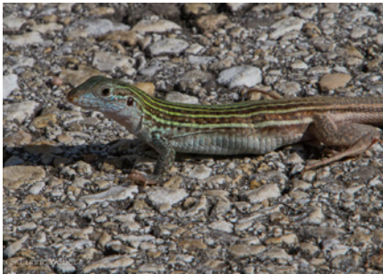
Common Spotted Whiptail

Small to medium-sized slender lizards, whiptails and racerunners can be distinguished from other lizard species by their generally granular dorsal (topside) scales, larger rectangular ventral (underside) scales arranged in transverse rows, long tails, and forked, snake-