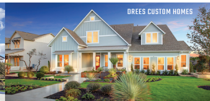
DREES CUSTOM HOMES

708 HEADWATERS BOULEVARD | DRIPPING SPRINGS, TX 78620