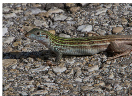
Common Spotted Whiptail

Small to medium-sized slender lizards, whiptails and racerunners can be distinguished from other lizard species by their generally granular dorsal (topside) scales, larger rectangular ventral (underside) scales arranged in transverse rows, long tails, and forked, snake-like tongues. Additionally, these species belong to the genus Aspidoscelis , from the Greek aspidos or 'shield' and skelos or 'leg', relating to their well-developed limbs that enable them to sprint at rapid speeds. Terrestrial and diurnal, these lizards are primarily carnivorous or insectivorous, actively foraging for food while temperatures are warm, and quickly skirting between objects for cover. Of the 22 species occurring in the southwest, Central Texas is home to the Common Spotted Whiptail ( Aspidoscelis gularis ) and Six-lined Racerunner ( Aspidoscelis sexlineata ).