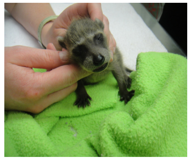
(Continued on Page 6)

We often receive calls from homeowners asking for advice on how to stop raccoons that are getting into trash cans. Solution: try using some bungee cords to secure the top. Another issue we hear about is that raccoons are eating food that is being put out for feral cats.