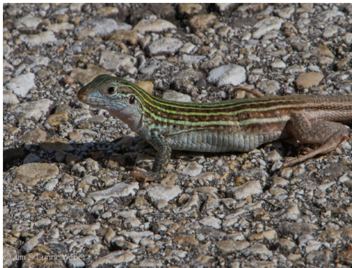
Common Spotted Whiptail

Small to medium-sized slender lizards, whiptails and racerunners can be distinguished from other lizard species by their generally granular dorsal (topside) scales, larger rectangular ventral (underside) scales arranged in transverse rows, long tails, and forked, snake-like tongues. Additionally, these species belong to the genus Aspidoscelis , from the Greek aspidō or 'shield' and skelos or 'leg', relating to their well-developed limbs that enable them to sprint at rapid speeds. Terrestrial and diurnal, these lizards are primarily carnivorous or insectivorous, actively foraging for food while temperatures are warm, and quickly skirting between objects for cover. Of the 22 species occurring in the southwest, Central Texas is home to the Common Spotted Whiptail ( Aspidoscelis gularis ) and Six-lined Racerunner ( Aspidoscelis sexlineata ).