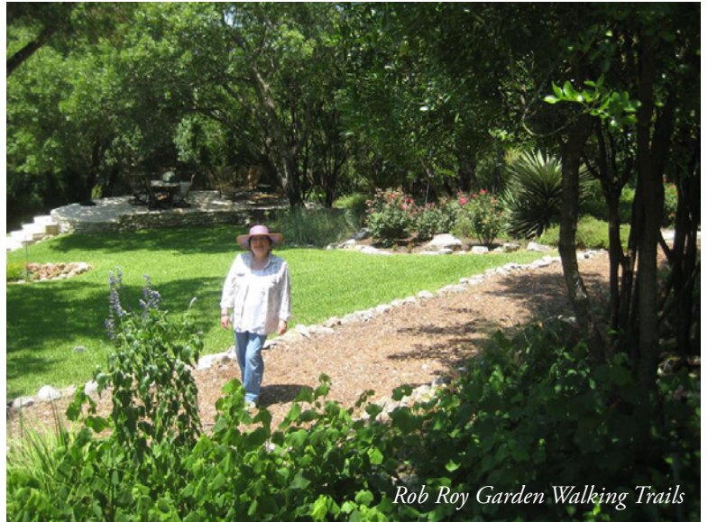
Rob Roy Garden Walking Trails