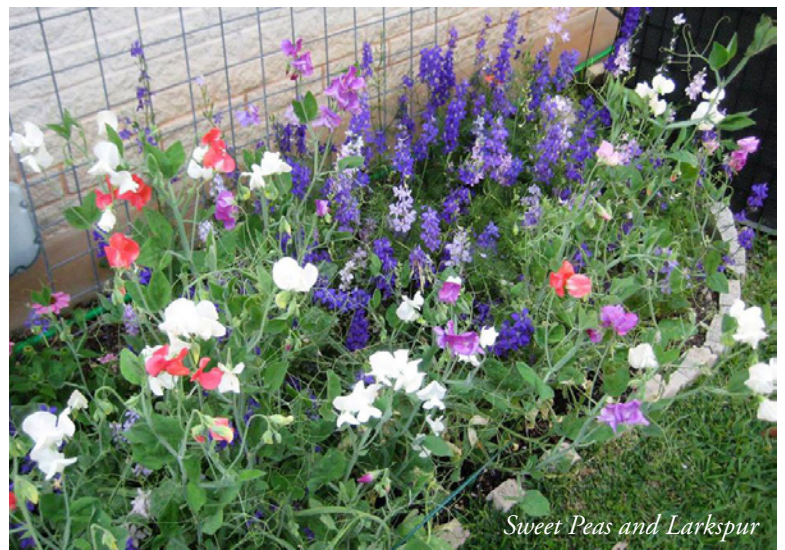
Sweet Peas and Larkspur