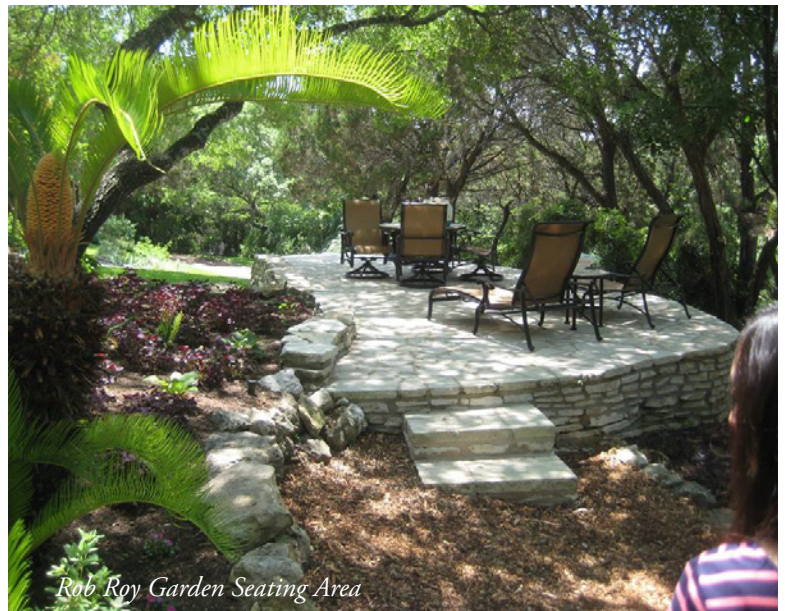
Rob Roy Garden Seating Area