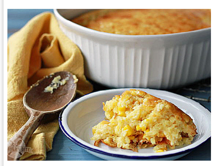
Paula's Classic Corn Spoon Bread is somewhere between cornbread and custard (four servings)