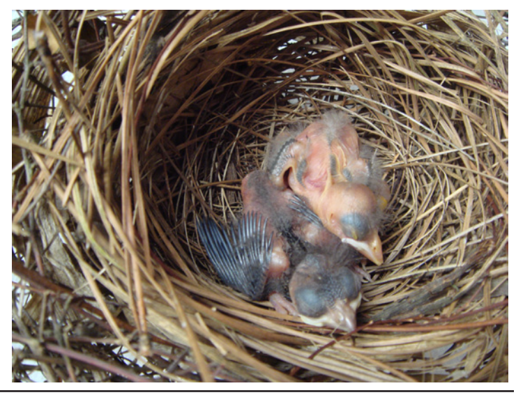
Normandy Forest - September 2018

TWRC Wildlife Center is a 39-year-old non-profit organization located in Houston, Texas. We are your resource for help with wildlife issues. Check out our website at www.twrcwildlifecenter.org or give us a call at 713-468-TWRC.