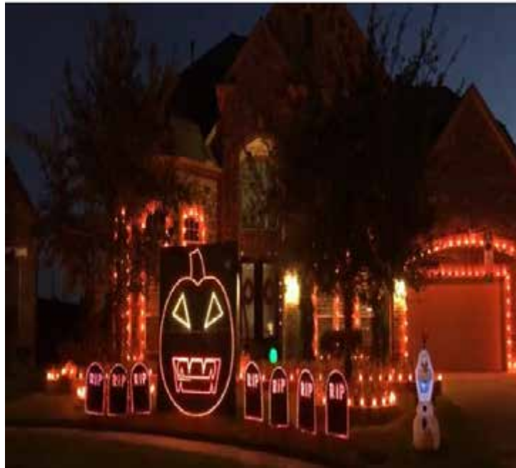
3627 Cardiff Mist Drive