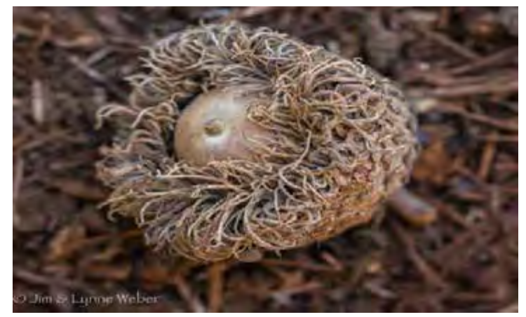
Bur Oak Acorn