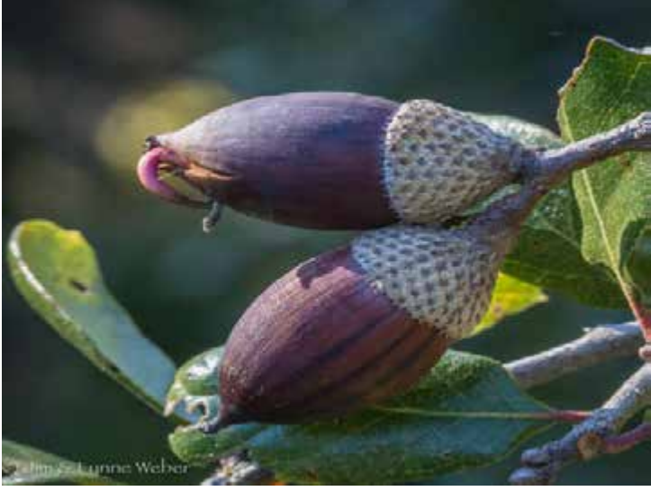
Live Oak Acorn

Famous for its oak trees, there are more than 50 species of oak native to Texas. In our region of Central Texas, some of the most common include Live Oak (Quercus virginiana), Texas Red Oak (Quercus buckleyi), and Bur Oak (Quercus macrocarpa).