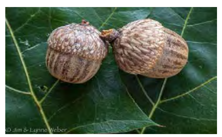
Texas Red Oak Acorn

Send your nature-related questions to naturewatch@austin.rr.com and we'll do our best to answer them. If you enjoy reading these articles, check out our books, Nature Watch Austin , Nature Watch Big Bend, and Native Host Plants for Texas Butterflies (published by Texas A&M University Press), and our blog at naturewatchaustin. blogspot.com.