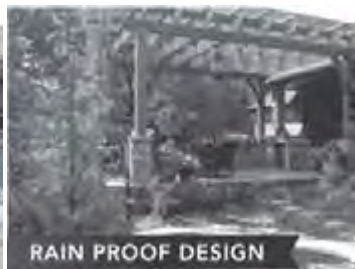
RAIN PROOF DESIGN