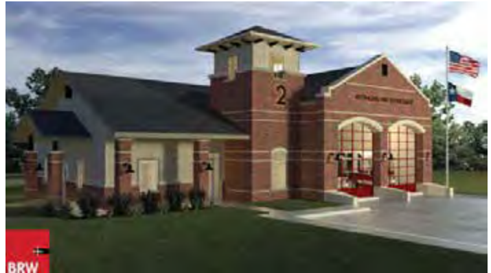
Architect Rendering of proposed Fire Station

Construction has started and scheduled to be completed by the Fall of 2019 for Fire station #2 3643 Williams Way Blvd Richmond TX 77469; near the intersection of Ransom Rd and Williams Way Blvd