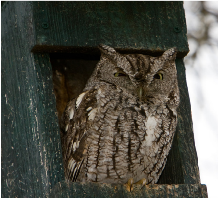
Eastern Screech Owl

Owls have fascinated man from time immemorial – to some cultures they are symbols of wisdom, while to others they are harbingers of doom and death. Adding to the mystique of these creatures is that they are mainly active at night, using their exceptional vision, acute hearing, and silent flight to stealthily hunt down their prey.