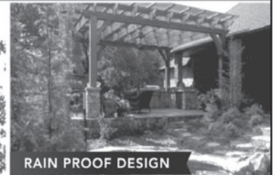
RAIN PROOF DESIGN