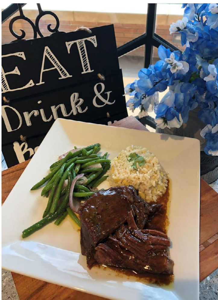
Braised Beef Marsala with Buttery Rice Pilaf and Fresh Green Beans