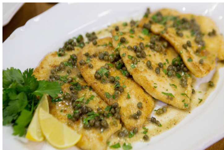
Chicken Picatta with Roasted Asparagus and Artichoke Hearts