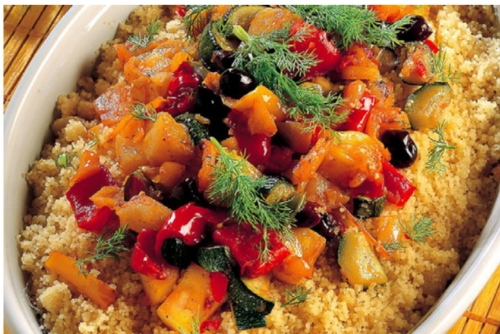
Mediterranean Chicken with Couscous and herbs

ENJOY A NEW CHEF SPECIAL AT ELYSON CAFÉ EVERY FRIDAY, AVAILABLE FROM 11AM – 9PM FOR DINE-IN OR CARRY-OUT!