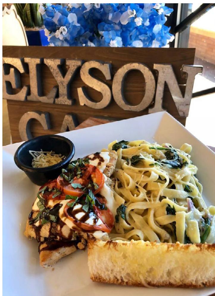
Chicken Pesto Caprese with Creamy Spinach Fettuccine and garlic bread