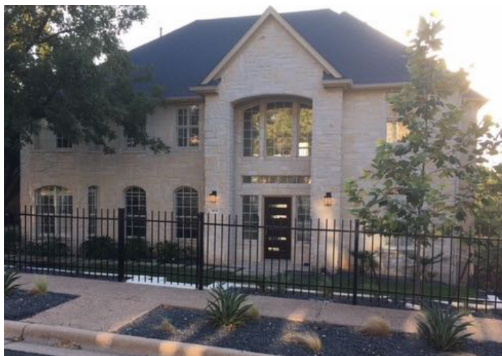
New 8121 Bottlebrush

One week FREE service for new customers!