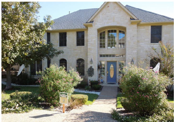
Old 8121 Bottlebrush

https://www.nwf.org/Garden-for-Wildlife/Certify or contact Dale Bulla, 512-345-9528 or dale-bulla@pobox.com