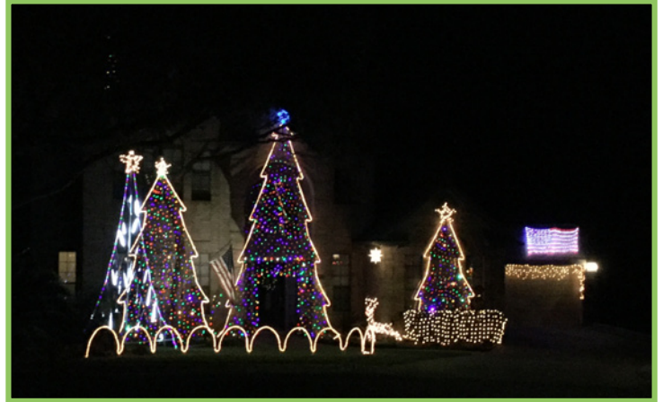
7407 Curly Leaf Cove