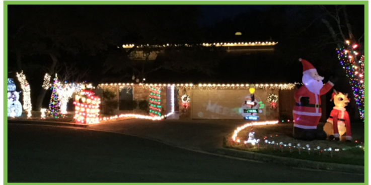
7005 Juneberry Cove

Thank you to everyone that made the 2018 Jester Holiday Lights Contest amazing! It was truly an honor to be a part of this wonderful annual tradition. We greatly appreciate those who submitted nominations, our generous neighborhood sponsors, and every homeowner that decorated for the holidays. Please do visit our community sponsors in the New Year!