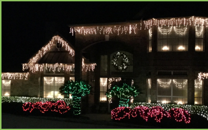
6600 Winterberry Cove