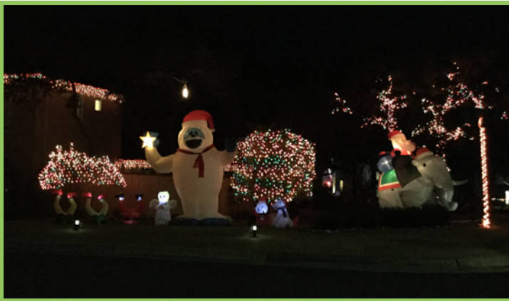
7401 Curly Leaf Cove