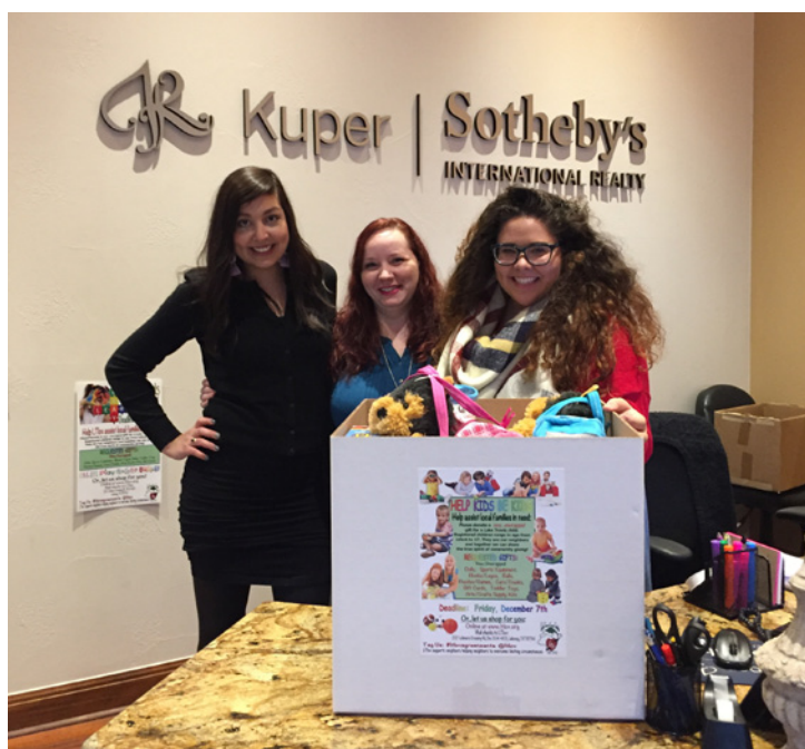
Pictured, Kuper-Sotheby's International Realty, one of many local businesses who hosted a collection bin, directed a very successful collection of toys for Green Santa.

LTlov would like to thank the Lake Travis community for sharing the joy of the season with local families whose limited finances make celebrating the Holidays a challenge. Once again, Green Santa was favored with a great outpouring of generosity which provided gifts and family meals to 672 children in the Lake Travis area. Neighbors helping neighbors was in full evidence and empowered this much beloved program to serve 204 local families in need of a little extra help with three gifts, stocking stuffers, books and a stuffed animal for each child and just under $13,000 dollars in H-E-B food cards provided to families to help stretch Holiday food budgets.