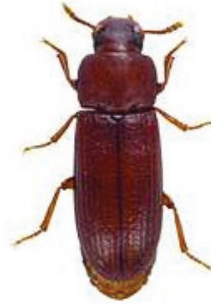
Red Flour Beetle

• Do not buy damaged or expired items from the grocery store.