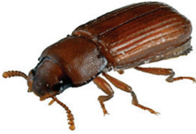
Confused Flour Beetle

where pet food is stored or areas with dried flowers or potpourri. Sometimes people see flour beetles during or after they have had a rodent infestation because the beetles can eat grain that may be in rodent baits or eat food from rodent nests where food was stored.