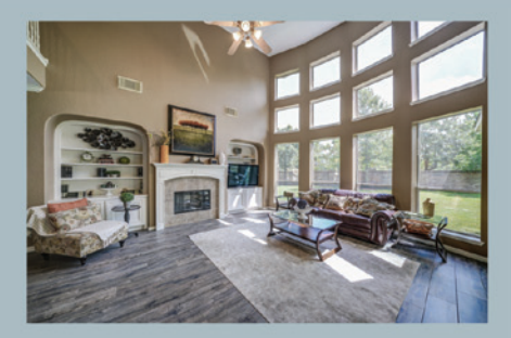
Home Staging Services