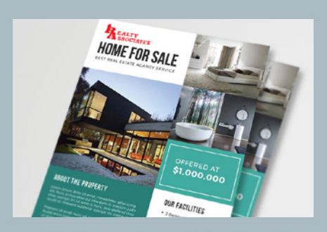
Full Color Marketing