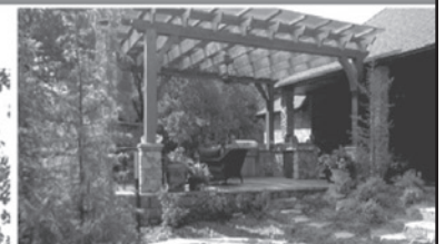
RAIN PROOF DESIGN