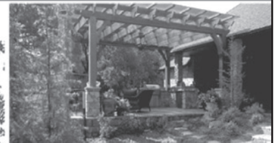
RAIN PROOF DESIGN