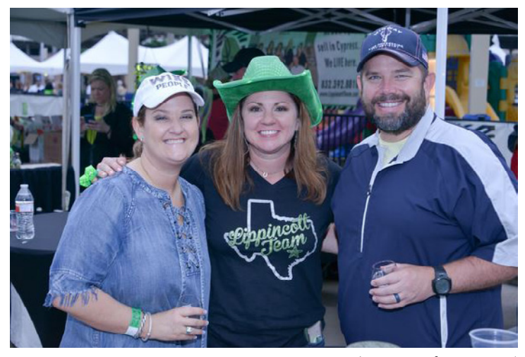
(Continued on Page 7)

General admission tickets are $40 per person, and include access to unlimited food samples, wine tastings, and interactive displays. Five dollars from every general admission ticket will benefit Reach Unlimited. Reach Unlimited will also host a wine pull and silent auction. VIP tickets are $75 per person, and include early entrance to the festival with a VIP lounge offering elevated food selections by Groupo Herrero. Groupo Herrero's international offerings will feature upscale VIP tastings by Alicia's Mexican Grille, Dario's Steakhouse & Seafood, Marvino's Italian Kitchen, and Galiana's Bakery & Café.