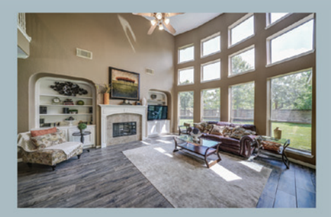
Home Staging Services