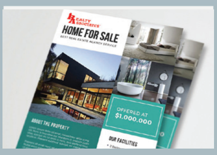
Full Color Marketing