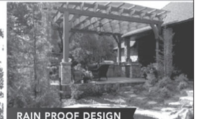
RAIN PROOF DESIGN