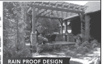
RAIN PROOF DESIGN