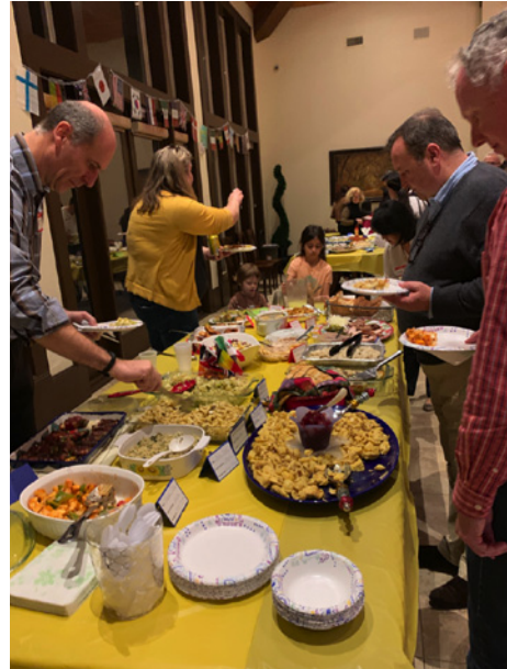
More Photos From International Potluck On Page 10