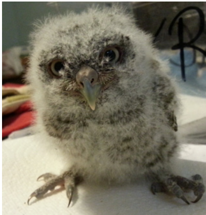
Baby Screech Owl

Have you ever heard of a hawk vest, raptor shield or coyote vest? I had no idea they even existed until I started researching this article. Although they may go by different names, they are all very similar and serve the same purpose. They claim to protect small animals from birds of prey, coyotes and even aggressive dogs. Now you may think this is silly and even a little