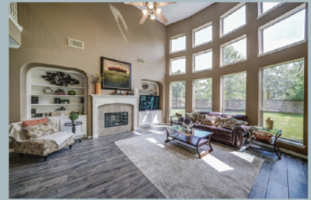
Home Staging Services