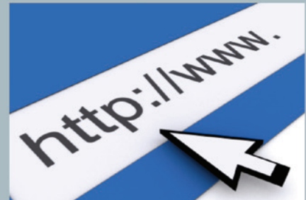
Custom Property Website