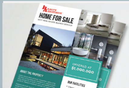
Full Color Marketing