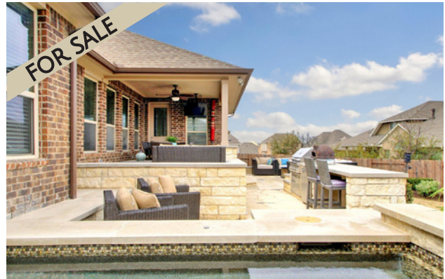
6020 Gunnison Turn - $489,000