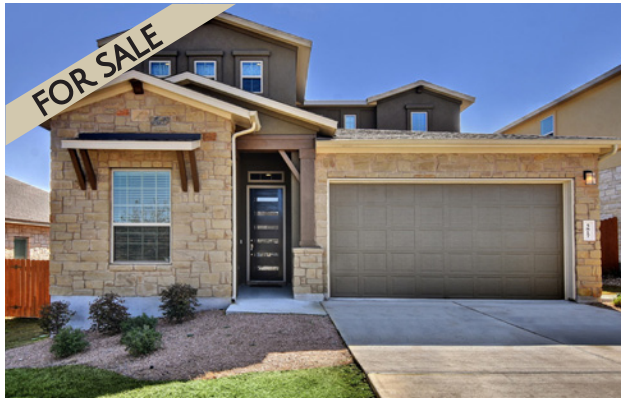
5817 Buchanan Draw - $435,000