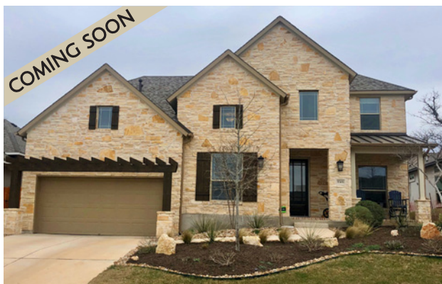
5301 Alonso Dr - $515,000

Did you know that May, June and July have the highest volume of home sales in Austin? If you are thinking of selling, now is the time to list! Call me for a free market analysis!