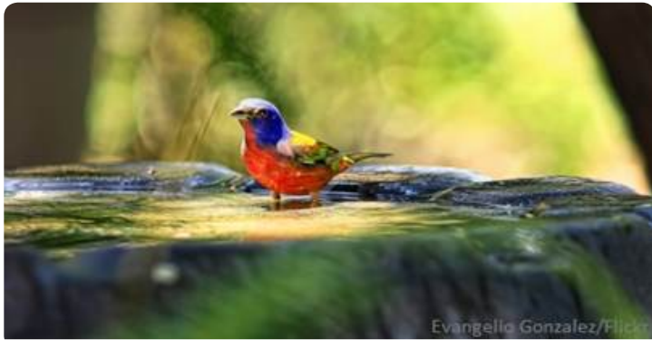
"Thank You, Jester!"

Because you are one of the more than 2,600 people in Travis County who have registered your property as a Certified Wildlife Habitat™ with the National Wildlife Federation, I write to share some great news.