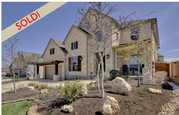
5301 Alonso Dr