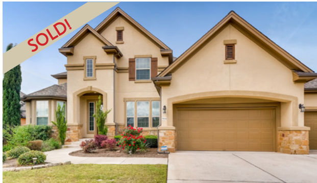
5504 Lipan Apache Bend Under contract in 1 day!