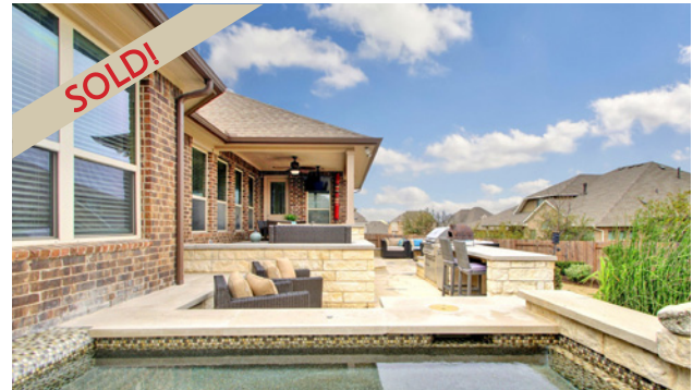
6020 Gunnison Turn RD Under contract in 5 days!