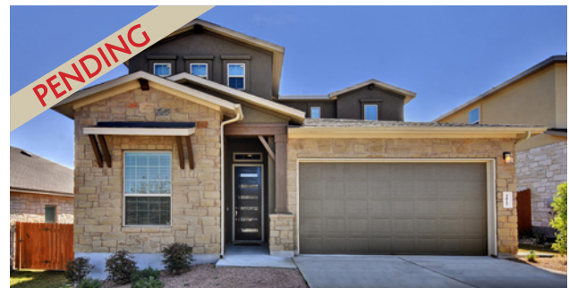
5817 Buchanan Draw